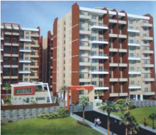
▲ SWAYAMBHU HILLS Kondhwa road