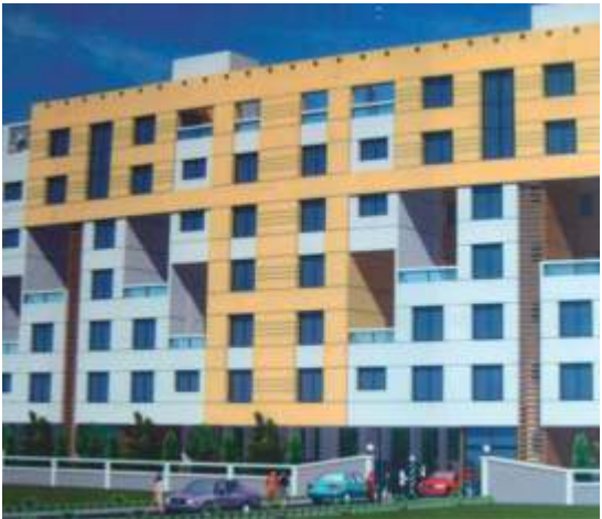
▲ MAHALAXMI - Gultekdi 2 & 3 BHK Residences