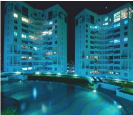
▲ HYDE PARK - Gultekdi 3 & 4 BHK Residences