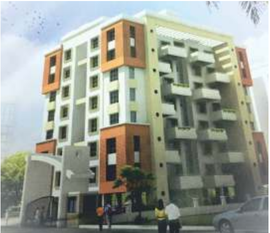
▲ TULIPS - Sinhagad Road 2 BHK Residences