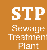
STP Sewage Treatment Plant