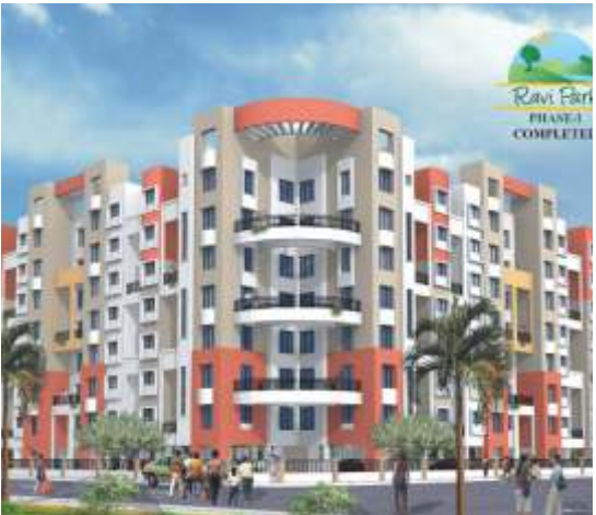
▲ YASH RAVI PARK - Hadpsar 1 & 2 BHK