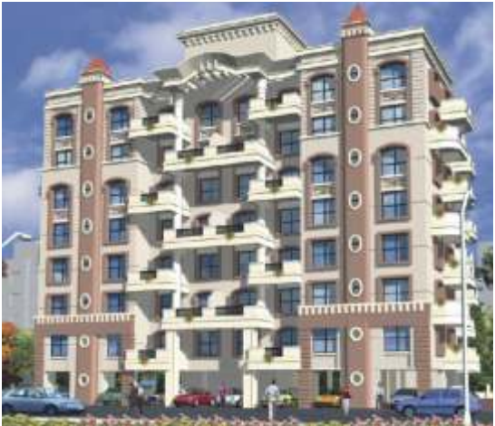
▲ GLOXINIA GREEN - Empress Garden 2 & 3 BHK Residences